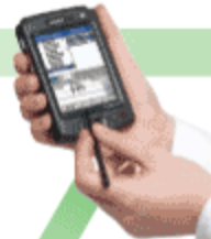
Wireless Handheld POS